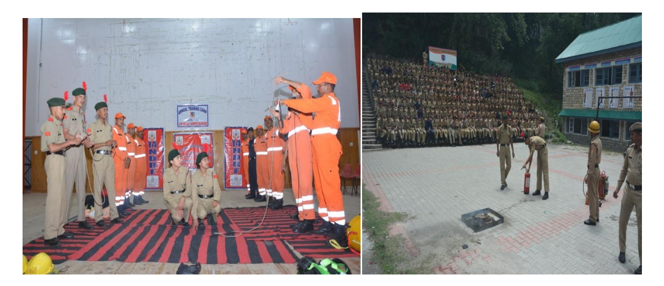
(NDRF and FAIR BRIGADE Class)