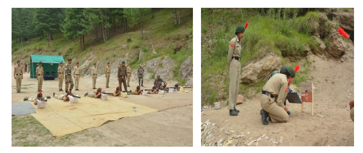
(Shooting Range and Target)