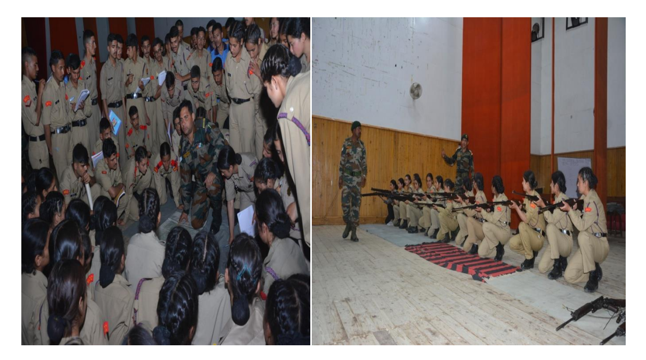
(Map Reading and Weapon Handling class)