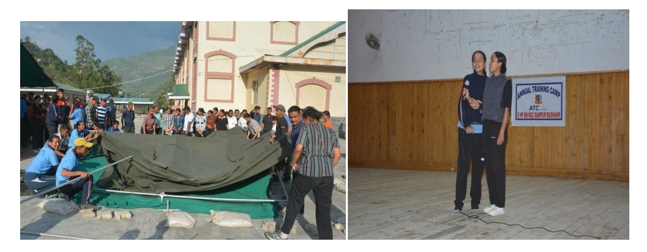
(Tent Pitching and Singing Competition)