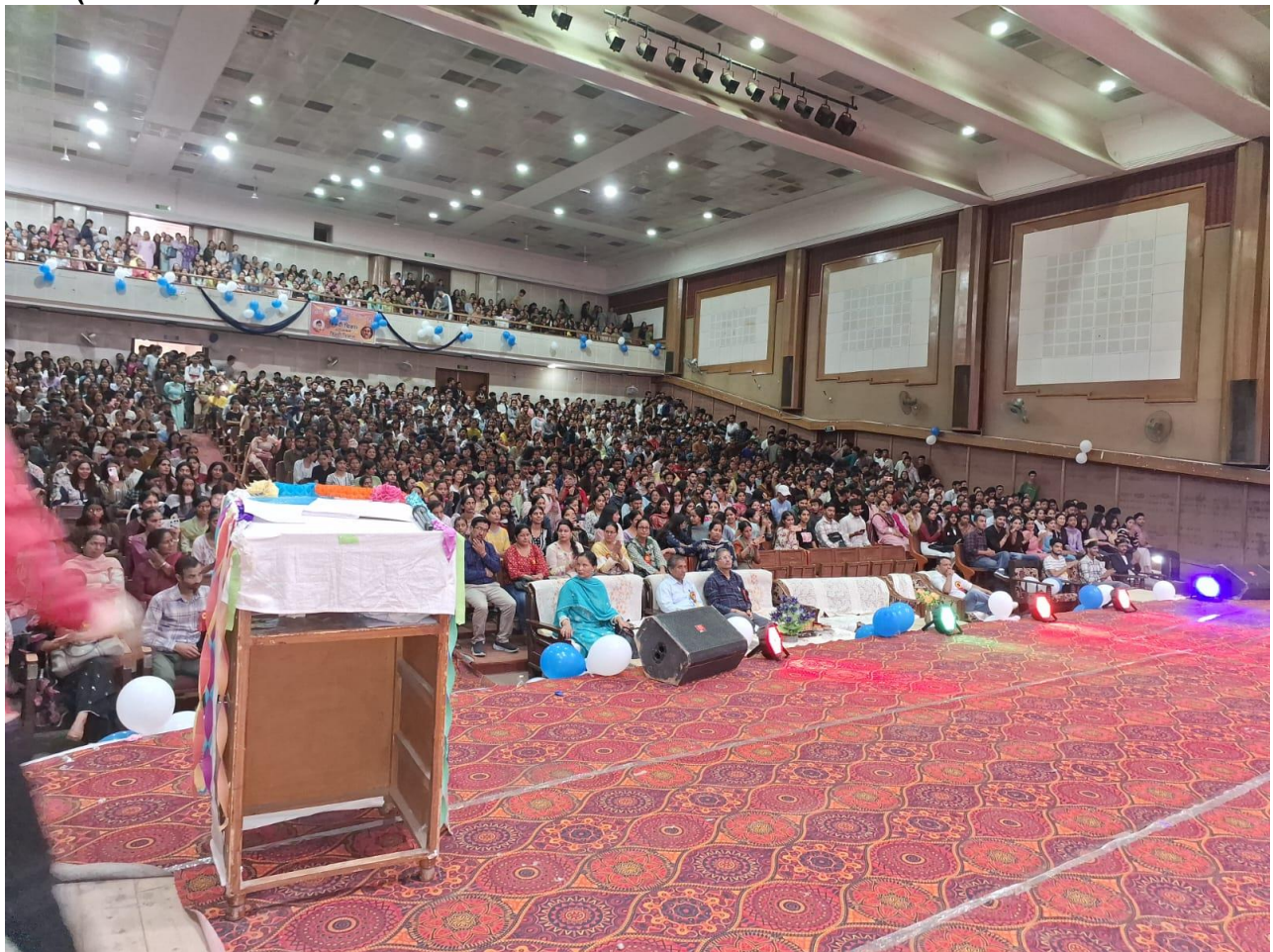
3.6 ( Auditorium Hall).